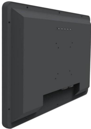
Back Side view