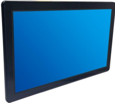
Front Side view